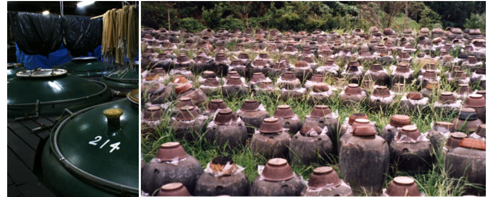
Functionalities produced by fermentation