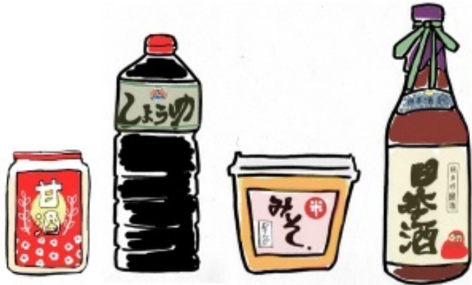
Traditional fermented foods = Slow food